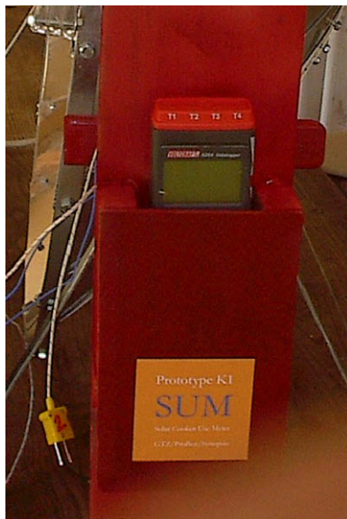
Fig. 1. View of the SUM prototype for the K-10 cooker.