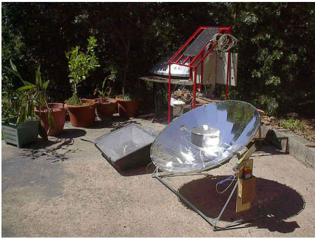
Fig. 3. K10 (right) and SunStove (left) during use meter tests at Synopsis.

To verify SUM results, output data were compared with actual conditions. The SUM was switched on; the cooker