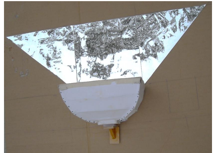
Exterior kitchen reflector wall above reflector box

Thru-wall solar kitchen with multi-tube racks roll in-out thru doors into the exterior cooking caustic zone, so that batch after batch can be cooked in a day. The multi-tube racks are within the volume of the exterior nonimaging reflector boxes, avoiding wind, and so that E and W end reflectors (repositioned at noon) flapping in wind gusts could not damage the tubes. The tubes can slip out of the racks for ease of tube cleaning.