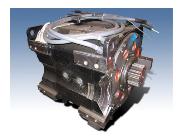
D43 Traction Motor