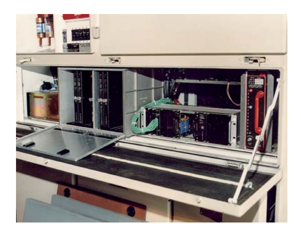
EM2000 Computer Application