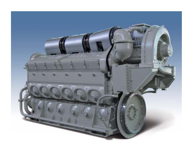
12N-710G3B-T2 Engine: Complies with EU Stage IIIA Regulations